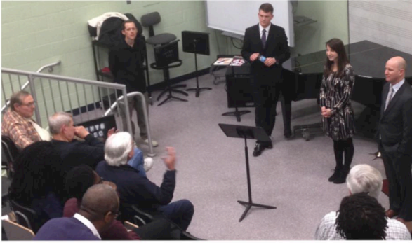
Members of the "President's Own" United States Marine Band present a clinic for DSU students and community members.