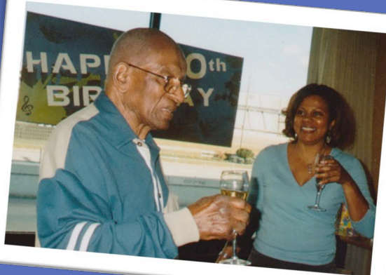
90th Birthday Celebration