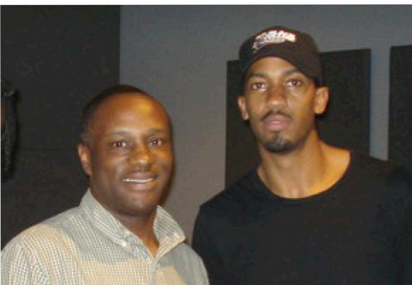
Mr. "Fonzworth Bentley" from the popular group Outkast visits our music recording studio to inspire music industry students.